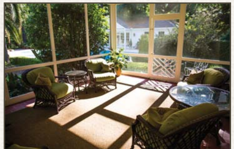
— CONSTRUCTED WITH ATTENTION TO EVERY DETAIL INDOOR AND OUT —